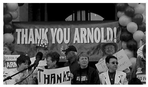
doing to get our state back on track!

River City Republicans love you Arnold and we will do everything we can to help you out.