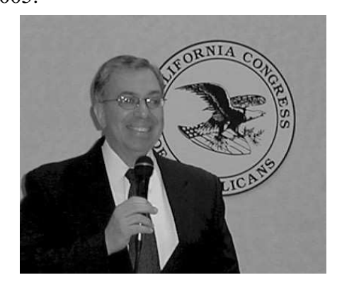
Senator Chuck Poochigian

Some scenes from the California Congress of Republicans convention, held in Fresno April 8, 9 and 10, 2005.