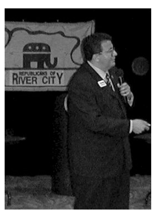
some of the aspects of using Voter Vault.

We pray for the British citizens killed, maimed and injured in the terrorist attacks on July 7 and for their loved ones.