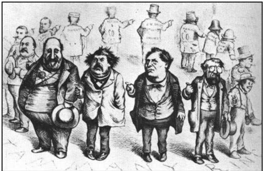
This Thomas Nast cartoon, titled "Who Stole The People's Money" is, except for the faces drawn on the figures, as apt today as it was when published in the 19th century. The figures are then prominent members of the Democrat Party in New York; some things never seem to change.