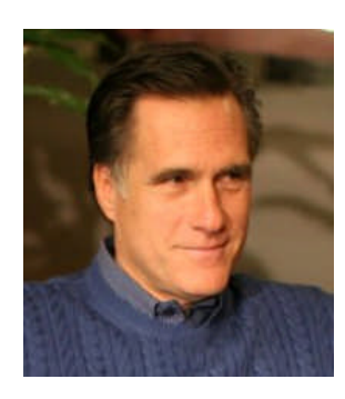
Governor Mitt Romney

raise taxes and he streamlined government programs and enacted economic reforms to stimulate growth in Massachusetts. This effort resulted in closing a $3 billion budget shortfall and moved the state from deficits to surpluses and helped the state add approximately 60,000 jobs in the last two years.